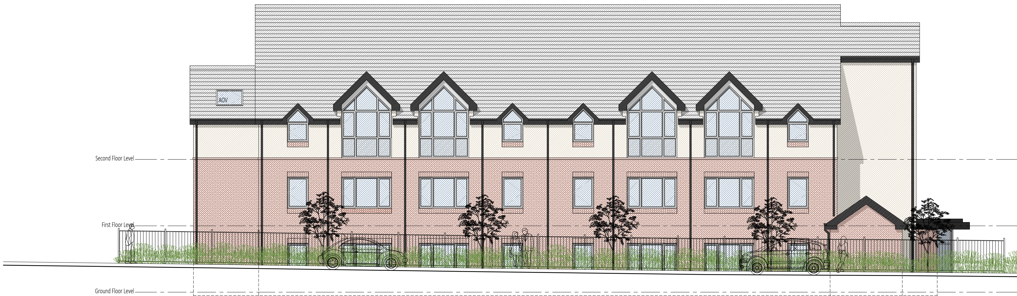
South Elevation - Street Scene